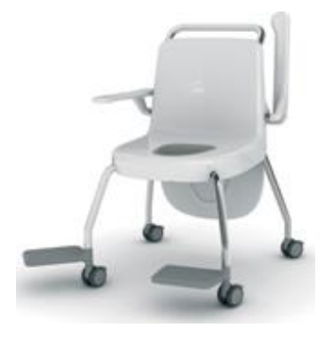
Fig.2 Commode prototypes

The primary requirements for the new commode model were to ensure that it was easy to clean,