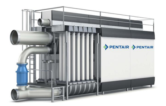
Fig. 4: X-Flow Airlift™ MBR – a commercially available system.