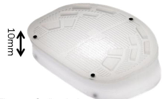
Figure 1: Cadisc device

The research has led to the development of two products that are specifically designed to treat patients suffering from degenerative disc disease – Cadisc®-L, which mimics the biomechanical