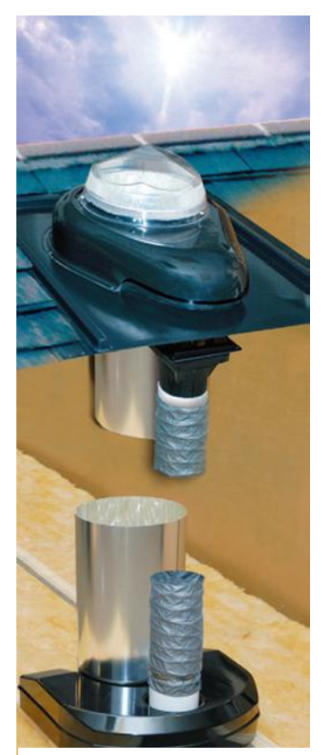
Figure 2: Sola-Vent demonstration unit

This ongoing collaboration with the University of Nottingham has been crucial to the company's growing success in the market. Sola-Vent products have been installed in supermarkets, stores, schools and other buildings and have earned Monodraught an increased share in the sector throughout the impact period.