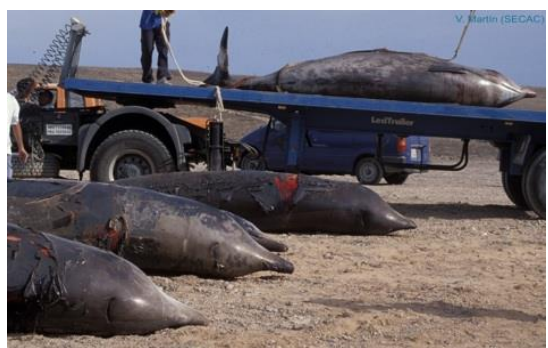
Beaked Whales Mass Stranded in the Canary Islands during a Naval Sonar Exercise in 2002

Subsequent to the demonstration that beaked whales show strong responses to Sonar at levels of 140 dB re 1 \mu Pa (reference 5 above), the US Navy modified its response criterion for beaked whales to this lower level to reduce the risks of exposure to harmful sound [S6] . In the period 2008-12 there have been no documented cases of mass strandings linked to US Navy Sonar [S7] .