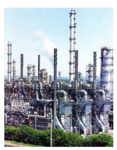
Basell's ethylene complex in Wesseling, Germany

1) Ethylene production [E1, E2]: Ethylene is one of the largest-volume industrial bulk commodity in the world. The majority of ethylene is used in the production of ethylene oxide, ethylene dichloride, ethyl-benzene, and a variety of plastics ranging from plastic food wrap to impact-absorbing dashboards inside cars. Honeywell assisted Basell Polyolefins GmbH, the world's largest producer of polypropylene (PP) and advanced polyolefins products, in the implementation of nonlinear MPC solutions to maximize profits from their ethylene plant. This implementation has resulted, starting from 2008, in these key benefits: a) substantial economic benefits, including ".. millions of dollars from increase production annually" [E1]; b) improved quality control on key units as a result of reduced control-variable standard deviations (including a 52% reduction in